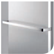
Accessories: see page 11

Elegant and efficient. The radiant heat from the large heating surface is particularly comfortable. Adjustable side panels extend the designer radiator right up against the wall. The mounting and technical components remain out of sight without interfering with the overall appearance. The smooth surface is easy to clean. Zehnder Fina is available in several gloss or matt colours and surface finishes. With its flat, minimalist design, Zehnder Fina blends into any modern bathroom.