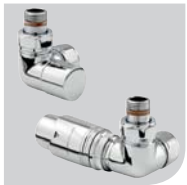
Valves: see page 118